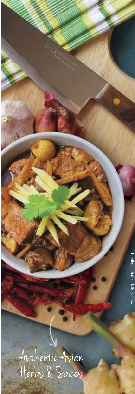
Northern Thai Pork Belly Stew