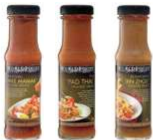
Noodle Sauces ↴

Noodles, a common ingredient in many Asian menus are usually cooked with various sauces and can be eaten anytime of the day. They make a nutritious and satisfying one-dish meal. There are oodles of different noodles – all versatile, quick to cook and can be used interchangeably in most recipes. WORLDFOODS' range of noodle sauces enables you to recreate authentic Asian noodle favourites right in your own kitchen with minimal efforts, stirring up your passion for noodles.