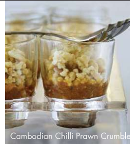
Cambodian Chilli Prawn Crumble