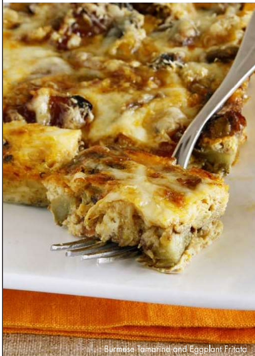
Burmese Tamarind and Eggplant Fritata