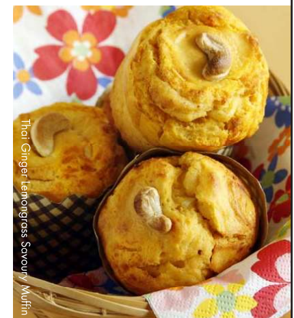
Thai Ginger Lemon Grass Savoury Muffin