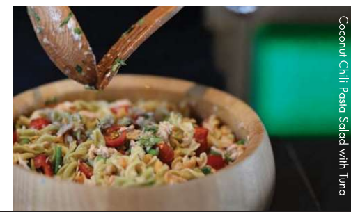
Coconut Chilli Pasta Salad with Tuna