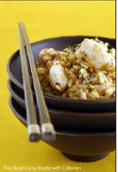
Thai Basil Curry Risotto with Calamari

The WORLDFOODS' Specialty Ingredients, cooking solution for home cooks to create their own unique creations. Our fresh concentrated ingredients are suitable in many ways to create an authentic Asian or Asian influenced dish. This can be stir-fried, marinade, baked or as garnishing.