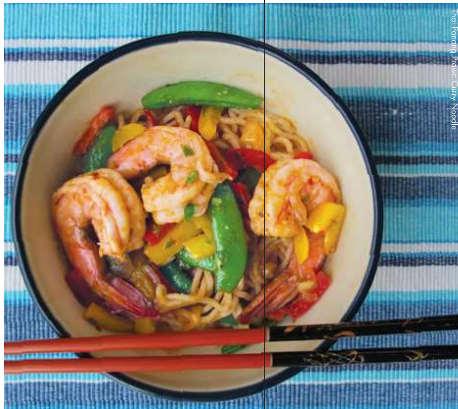
Thai Panang Prawn Curry Noodle