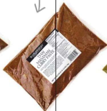
1kg pouch Thai Masaman Curry Paste