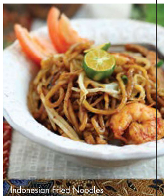
Indonesian Fried Noodles