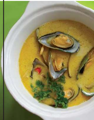
Mussels in Galangal Coconut Soup