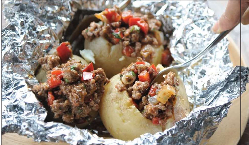
Baked Potato with Beef Massaman Filling