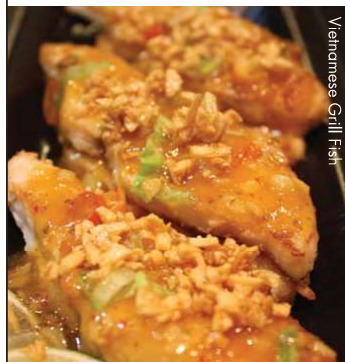
Vietnamese Grill Fish