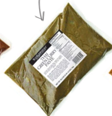
1kg pouch Thai Green Curry Paste