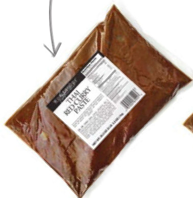
1kg pouch Thai Red Curry Paste